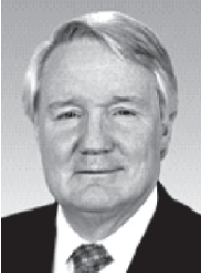
CONGRESSMAN JOHN BRYANT CHAIRMAN OF THE BOARD

"Education is the most powerful weapon which we can use to change the world."